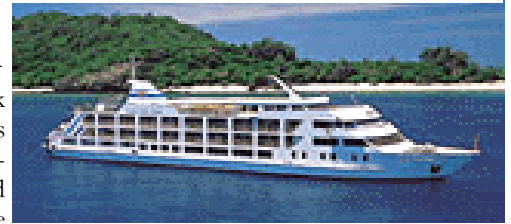
THE GRAND MV REEF ESCAPE

Captain Cook Cruises is the best way to discover the real Fiji. Every cruise is designed to offer guests an authentic and personal experience in style.