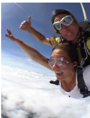
Hurling through the Fijian sky at 200 kilometers an hour!

These prices are only on sale until the 31st August and are valid for travel until the 31st March 2006 which would ideally suit any couples heading over to Fiji with us for the Savusavu Friendly Tournament in August of this year. What a perfect extension package to be able to head to Denarau Marina and relax on a 3, 4 or 7 night cruise through the Mamanuca and Yasawa Islands! The other bonus offered for our clients traveling on this great special is that children aged up to 18 years of age will be able to travel on a child's rate, which is only usually applicable to children aged 3-15yrs. These are some great specials and I would advise anyone really wanting to relax to take the opportunity!