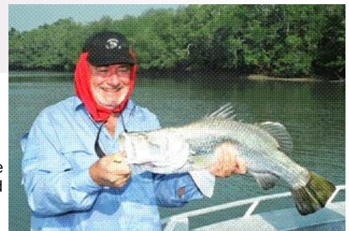
A very happy man with his first Barramundi