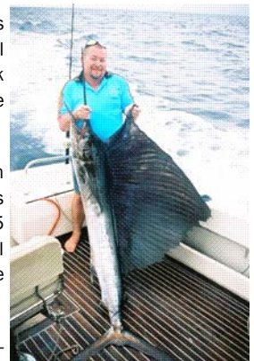
29.2kg Sailfish caught at last years tournament!

Savusavu is a beautiful part of Fiji but there is so much more to see! If you are feeling game we can even organize a sky dive for you or a lovely relaxing 3 day cruise through the Mamanuca Islands - the choice is yours!