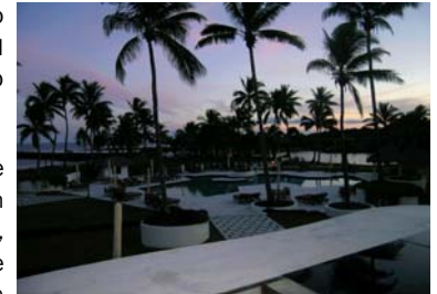
Looking over The Pearl South Pacific Resort at sunset

The Pearl, has recently been refurbished and now boasts some of the best food in the South Pacific with your food and beverage manager being flown in from New Zealand and possessing some of the best training around. The whole resort is littered with daybeds for extreme relaxation and comfort, and has the most beautifully located bar/restaurant right on the water. It is a small and intimate place perfect for conferences and couples getaways with the best service around.