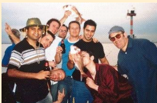
A great day out on the bay with the boys!

It is shaping up to be a great 5 days... We look forward to seeing and meeting many of you there! For ticket enquiries, please contact us on (03) 9807 6622.